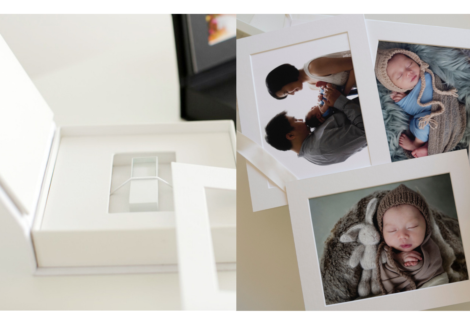
DIGITAL PORTRAIT COLLECTION AND A SET OF MUSEUM GRADE MOUNTED FINE ART PRINTS